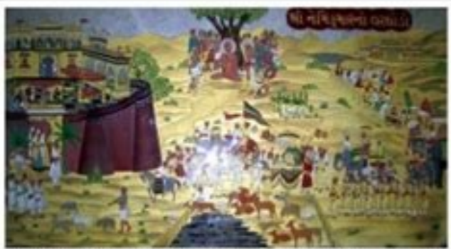
Depiction of wedding procession of Lord Neminatha. The enclosure shows the animals that are to be slaughtered for food for weddings. Overcome with Compassion for animals, Neminatha refused to marry and renounced his kingdom to become a Shramana.