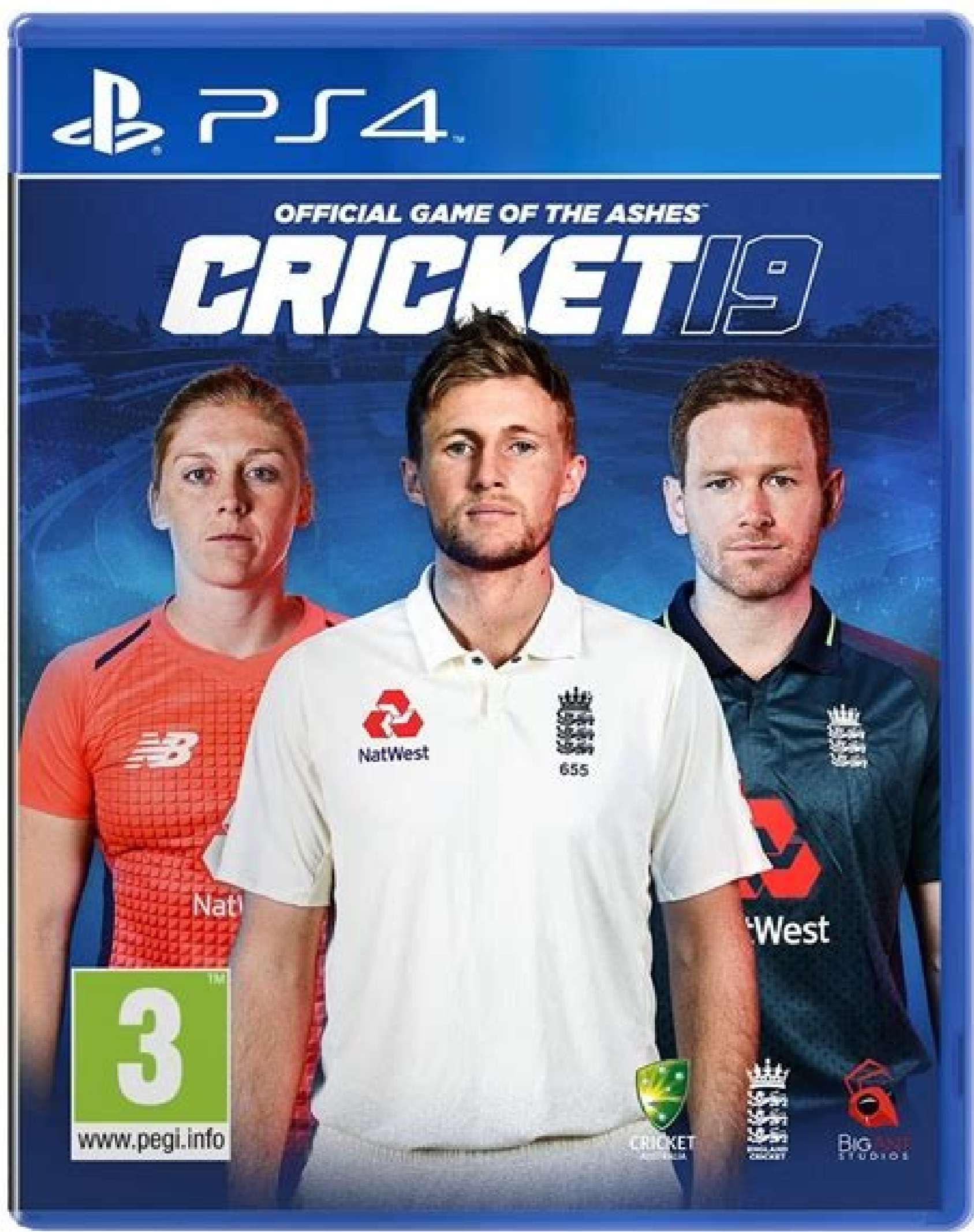
Ashes cricket game ps4 amazon. How to play ashes cricket. Ashes cricket 2019 game ps4. Ashes cricket game ps4 cheats. Cricket 22 - the official game of the ashes (ps4).